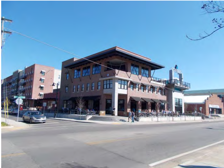
The completed College Town development (Phase 1) at Madison Street and Woodward Avenue.