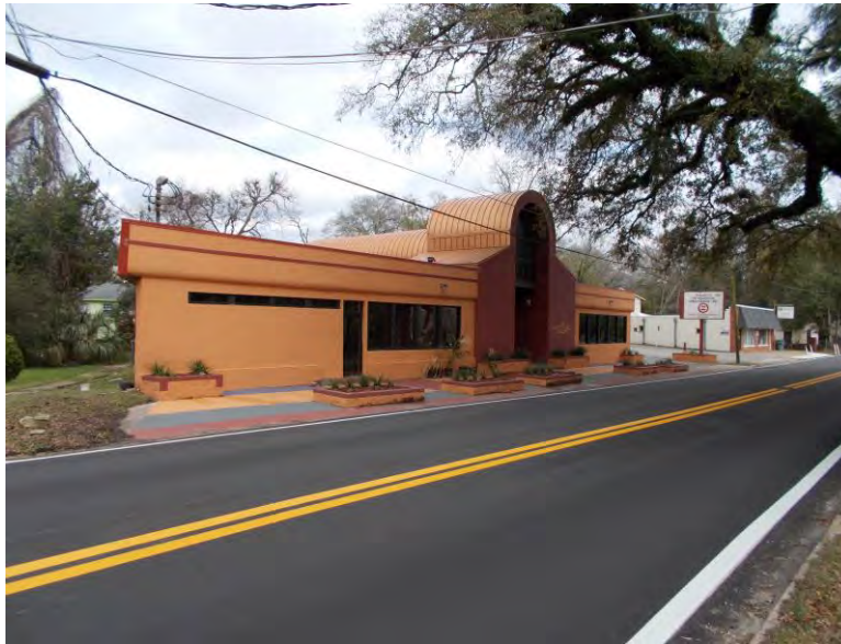
The Tallahassee Urban League building following renovations