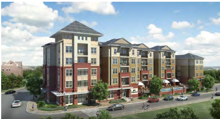
A rendering of 601 South Copeland project from St. Augustine Street.