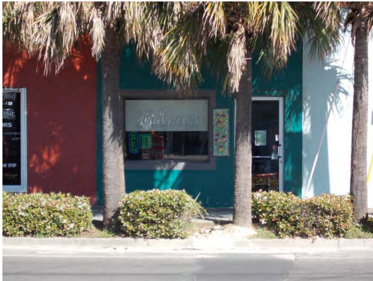
Wild Greens Café shortly after its opening in November 2012.

Wild Greens Café, 915-2 Railroad Avenue. In August 2012 Lia C. Chasar, LLC, d/b/a Wild Greens Café, received a $9,800 retail incentives loan for interior improvements and the purchase of furnishings, fixtures and equipment (FFE) for a vegetarian restaurant located in the Bread & Roses Food Cooperative on Railroad Avenue. The total estimated cost of the interior build out and FFE was $97,550. The CRA loan funds were supplemented with a cash investment and FFE already owned by the applicant. Renovations began in September 2012 and the restaurant opened in November 2012. Unfortunately, the applicant filed for bankruptcy in October 2013. CRA staff was able to recover approximately $6,100 of the outstanding loan balance through the sale of collateralized restaurant FFE.