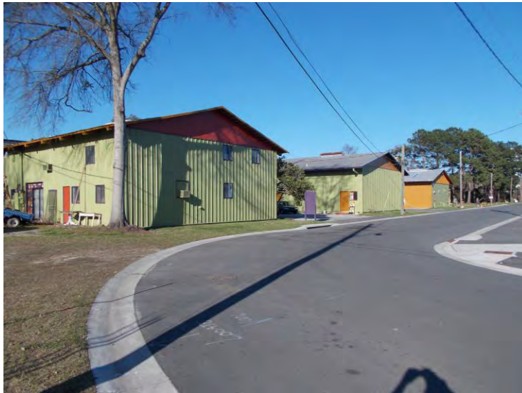
The repainted buildings at 670, 688 and 694 Industrial Drive.

Railroad Square . Four commercial painting grants totaling $22,814 were awarded to Railroad Square, LLC to paint four commercial buildings on five parcels within Railroad Square: 670 Industrial Drive, 688 Industrial Drive, 694 Industrial Drive and 1026 Commercial Drive (two parcels). The paintings were completed during the fiscal year.