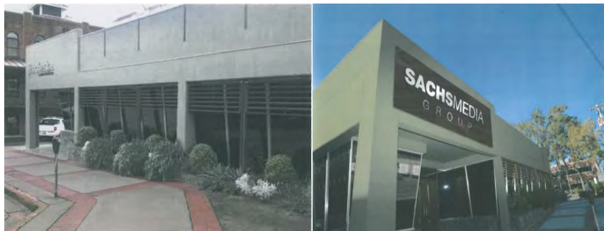
Sachs Media Group building before façade renovations (left) and after (right).

Sachs Media Group, 114 South Duval Street. In March 2013, Sea Moon Properties, LLC, received a commercial façade improvement grant of $8,489 for a new sign, re-staining of front louvers and wood doors to match the new sign, and repairs to the parapet on the front occupied by the Sachs Media Group, Inc. The low bid of qualified items for the exterior improvements was $16,979. During the renovations the applicant elected to omit the LED backlighting for the sign, which reduced the grant amount to $5,786.15. The exterior renovations were part of a larger interior renovation that will improve the functionality of the building. The total estimated cost of the exterior and interior improvements is $300,000. The façade improvements were completed in July 2013.