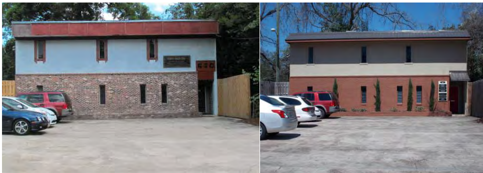
The Beasley building before façade renovations (left) and after (right).

Beasley Building, 630 West Brevard Street. In January 2013, Stephen Beasley received a commercial façade improvement grant of $8,950 for exterior improvements to his building that included the replacement of the entry door, improved lighting, adding trim to the windows, adding stucco to the front of the second story, staining the brick front, and replacing the existing roofline with a decorative metal overhang. The renovations were completed in May 2013.