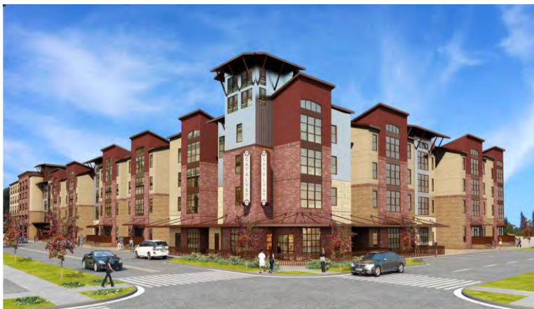
A rendering of the proposed Catalyst development Madison Street.