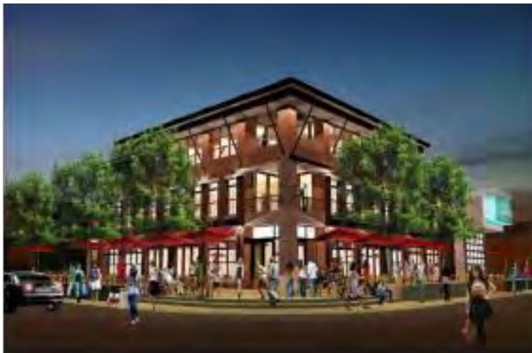
Rendering of College Town at Madison Street and Woodward Avenue.