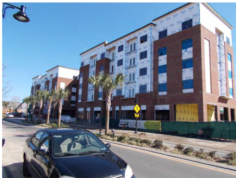
The Block under construction on Gaines Street.