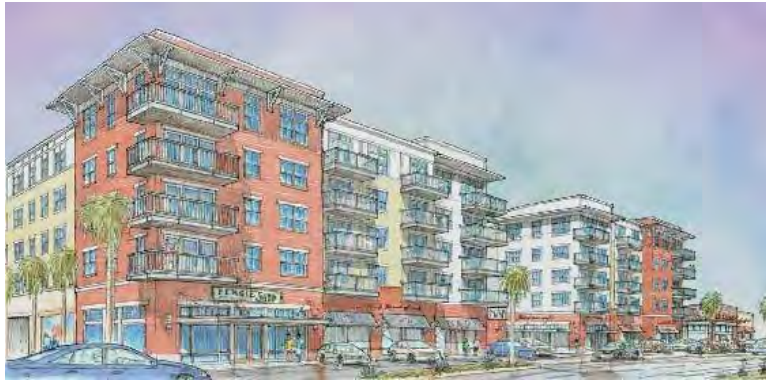
A rendering of the Block from across Gaines Street.