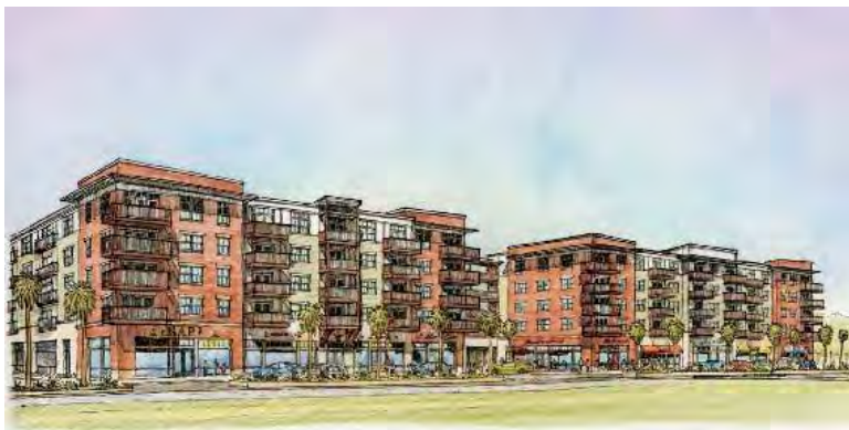
A rendering of the Deck from across Gaines Street.

464 parking spaces, and 13,080 square feet of retail space. The Block is a 156,128 square foot development with 124 residential units (224 beds), 245 parking spaces, and 13,840 square feet of retail space. The CRA grant funds are being used to purchase up to 174 public parking spaces (141 spaces in the Deck and 33 spaces in the Block), and to help to offset some of the retail development expenses, public plaza improvement and design upgrade costs. Construction on both developments began in early 2013 and is expected to be completed by June 2014. The development will be added to the tax rolls in 2015, and will generate tax increment for the CRA starting in FY 2016. The two developments are projected to have a post-construction taxable value of $34.3 million, an increase of $32.3 million over the current taxable value.