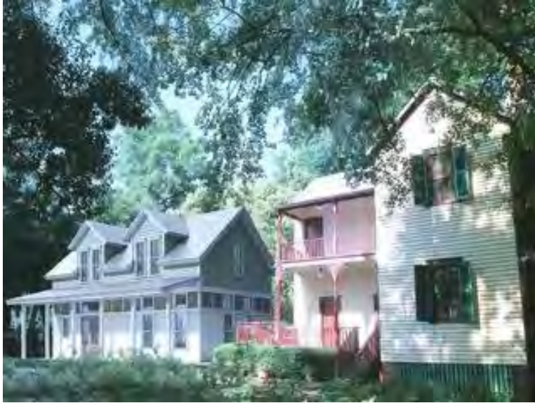
Riley House Visitor's Center (left) and the Riley House (right).