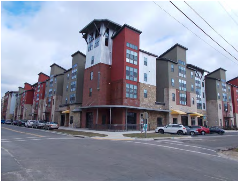
The completed Catalyst development from Madison Street.