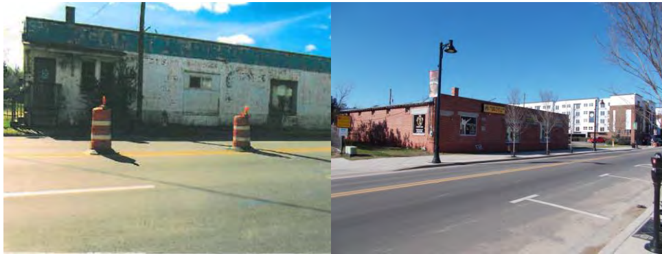
The Franklin Worth building before façade renovations (left) and after (right).

Franklin Worth Building, 729 West Gaines Street. In July 2012, the Franklin Worth Trust received a commercial façade grant of $24,779 for a variety of exterior improvements, including removal of paint from the brick façade; repairs to the brick façade; the installation of new windows, doorway, and entrance deck on the north side of the building; the installation of awnings on the west side of the building; the replacement of a garage door on the south side of the building with French doors; and the construction of wooden railings around the existing concrete deck on the south side. The cost of the exterior façade improvements was in excess of $50,000 and the total cost of exterior and anticipated interior renovations to the building was estimated at more than $100,000. The façade renovations were completed in February 2013.