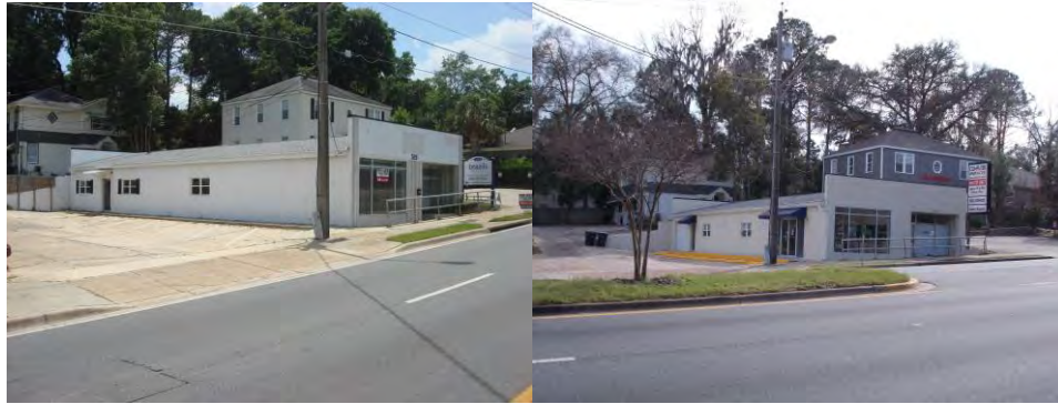
The Botel building before façade renovations (left) and after (right).

Botel Building, 523 East Tennessee Street. In July 2012, Robert and Tanya Botel received a commercial façade improvement grant of $28,155 for a variety of exterior improvements to their building, including the application of a stucco covering to the existing concrete block exterior, installation of an overhead delivery door, installation of a new side entrance door, installation of a new glass storefront on Tennessee Street, new awnings and gutters, new exterior lighting, and the expansion of an existing concrete pad extending out from the east building. The cost of the exterior façade improvements was in excess of $60,000 and the total cost of exterior and anticipated interior renovations to the building was estimated at more than $70,000, not including tenant improvements. The façade renovations were completed in November 2012.