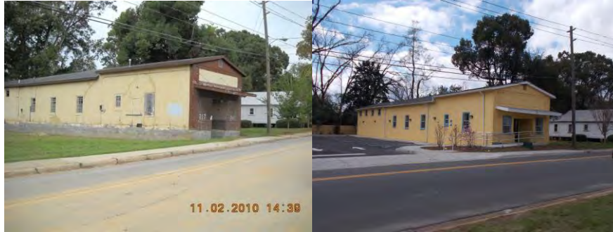
The NAACP's Franklin building before (left) and after (right) renovations.

Occupancy from the City of Tallahassee. The CRA funded renovations began in March 2013 and were completed in May. The NAACP was still working on interior and site improvements at the end of the fiscal year.