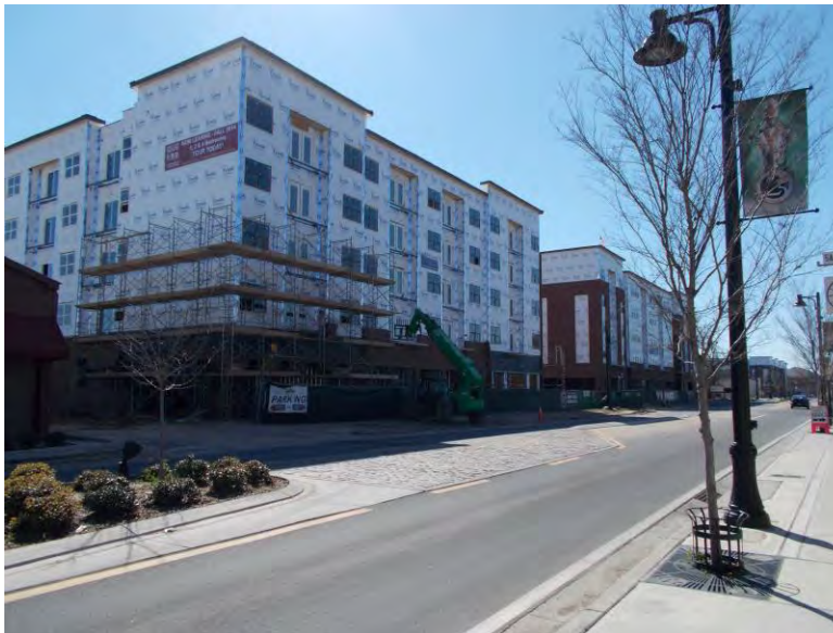
The Deck under construction on Gaines Street.