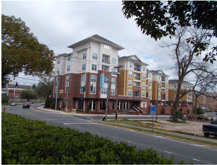
The completed 601 South Copeland from St. Augustine Street.