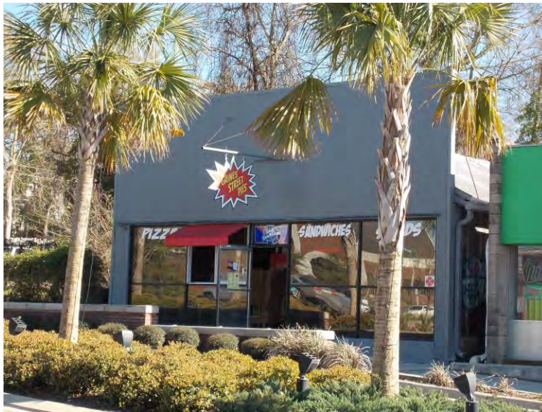
Gaines Street Pies opened in February 2013.

Gaines Street Pies, 507 West Gaines Street. In December 2012 Pizza Bros, LLC, d/b/a Gaines Street Pies, received a $10,000 retail incentives loan for interior improvements and the purchase of FFE for a pizza restaurant that would be located in a vacant retail building. The total estimated cost of the interior build out and FFE was $42,000. The CRA loan funds were supplemented with a cash investment by the restaurant partners and financed equipment. The applicants used only $9,007 of available loan funds. At the time of the application, the applicants estimated the restaurant would create six full-time jobs and three to six part-time jobs. Gaines Street Pies opened in February 2013 and has become one of several favorite eating places on Gaines Street.