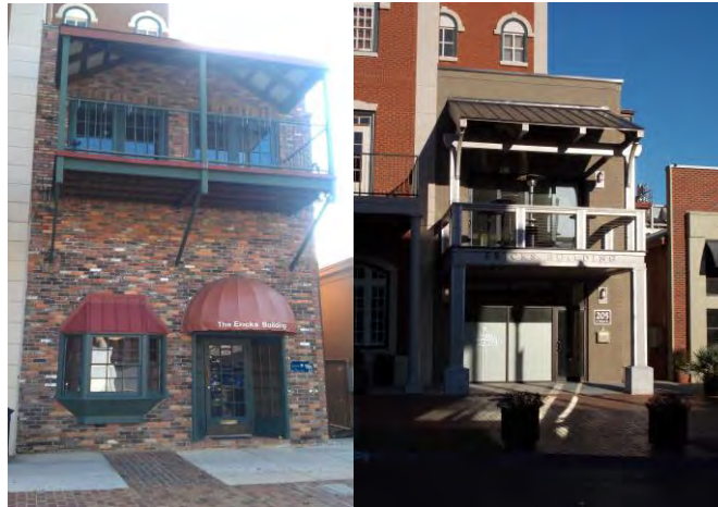
The Ericks building before (left) and after (right) renovations.

Sachs Media Group, 114 South Duval Street. In March 2013, Sea Moon Properties, LLC, received a commercial façade improvement grant of $8,489 for a new sign, re-staining of front louvers and wood doors to match the new sign, and repairs to the parapet on the front occupied by the Sachs Media Group, Inc. The low bid of qualified items for the exterior improvements was $16,979. During the renovations the applicant elected to omit the LED backlighting for the sign, which reduced the grant amount to $5,786.15. The exterior renovations were part of a larger interior renovation that will improve the functionality of the building. The total estimated cost of the exterior and interior improvements is $300,000. The façade improvements were completed in July 2013.